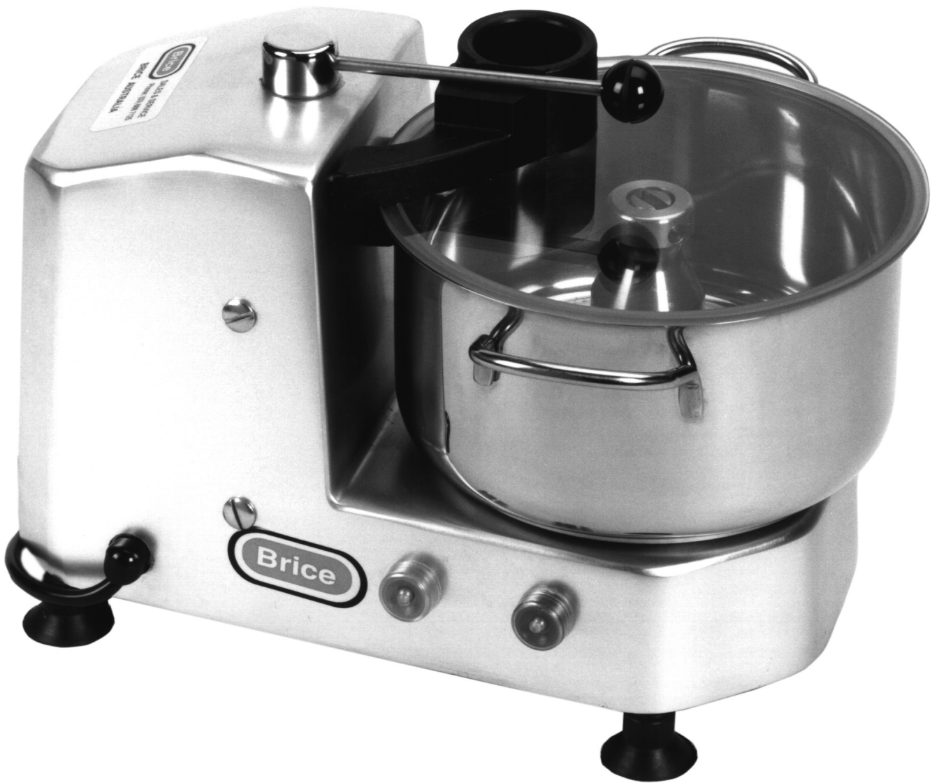
Model CT 35 Cutter