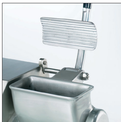
The the large inlet makes handling large food pieces a breeze.