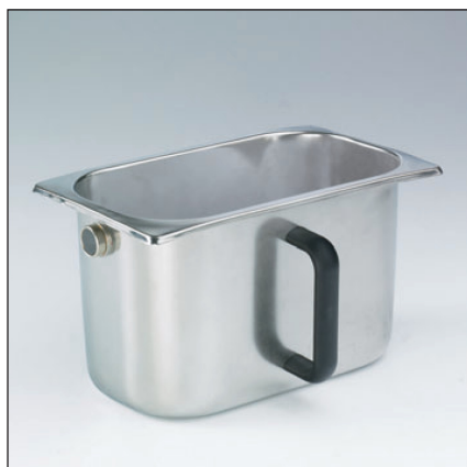
The optional stainless steel container.