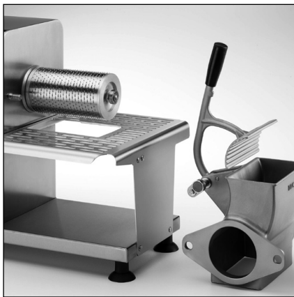
The CEGF2 disassembles for easy cleaning.