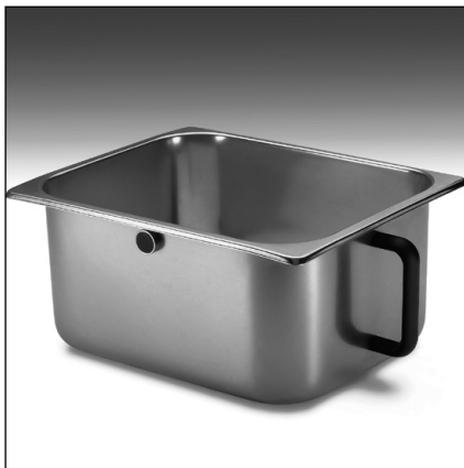
The optional stainless steel container.