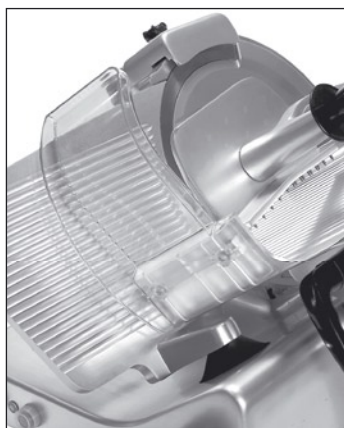
Fully guarded meat table and integrated sharpener keep operator safe.