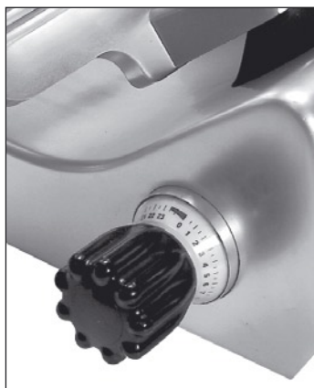
Micrometric adjustment for accurate slicing.