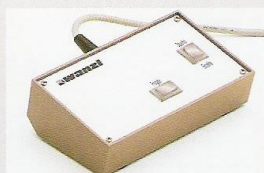
Standard control console Function: Individual passage adjustable from 1 to 16 seconds. Permanent passage: the system remains open