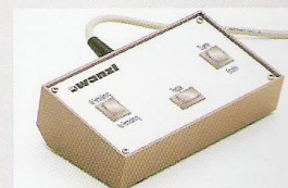
Special control console Function: System control: via radar or manual Individual passage adjustable from 1 to 16 seconds. Permanent passage: the system remains open